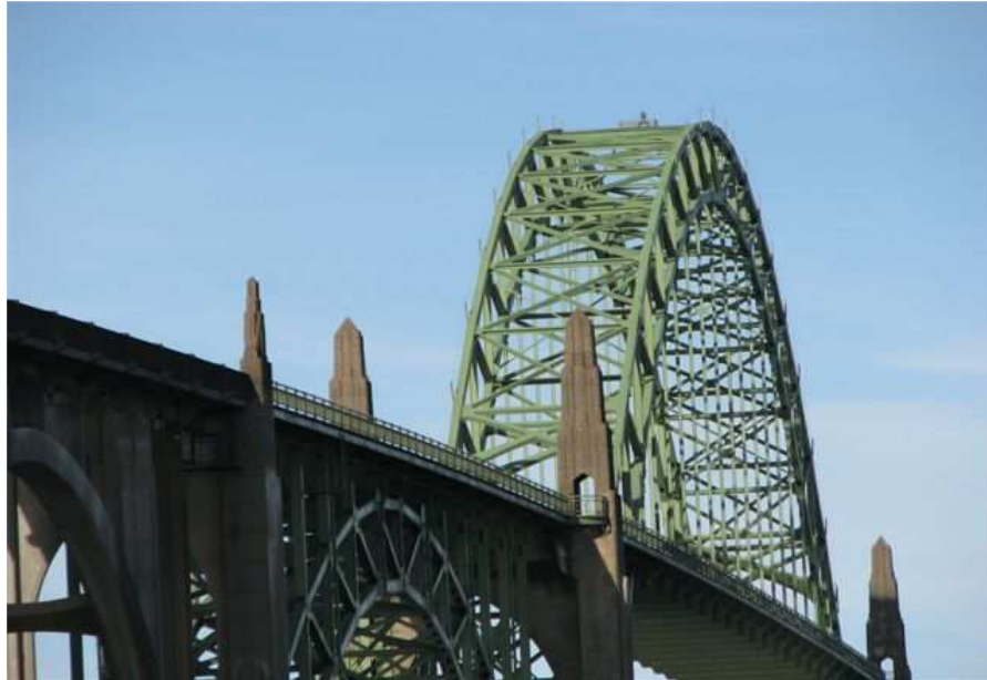
Yaquina Bay Bridge