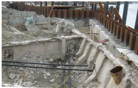
Installation of tension rods through the Hennebique

For more information on the International Terminal Project go to the port's website www.portofnewport.com under Port Projects.