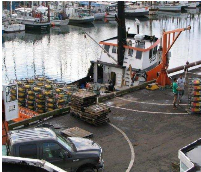
The Crew at Work